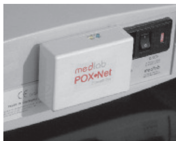
Transmitter for the POX·Net.

medlab medizinische Diagnosegeräte GmbH Mannheimer Strasse 16-18 D 76131 Karlsruhe Tel.: +49 (0) 721 62512 0 FAX: +49(0)721 62512 12 sales@medlab-gmbh.de