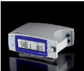
Large numerical screen for easy surveillance of the patient's vital parameters.