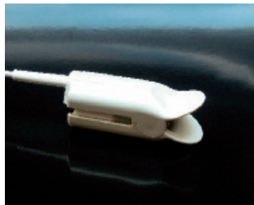
PEARL adult fingerclip sensor.