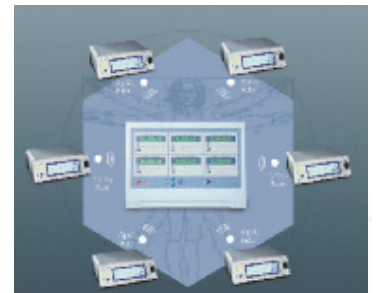
POXNet System - Central Monitoring for SpO 2 and Pulse with wireless transmission.